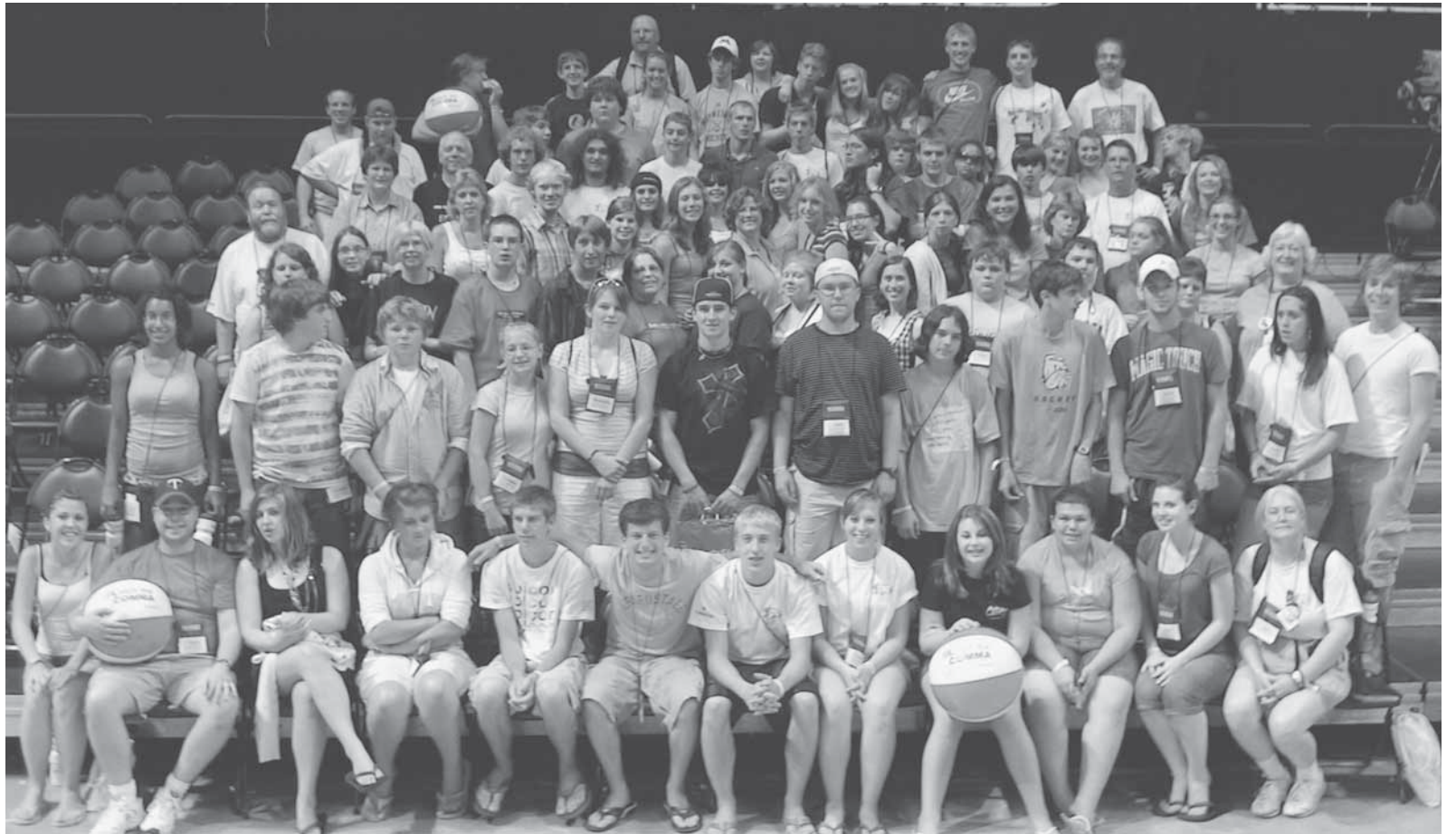
The Minnesota Conference represents at NYE