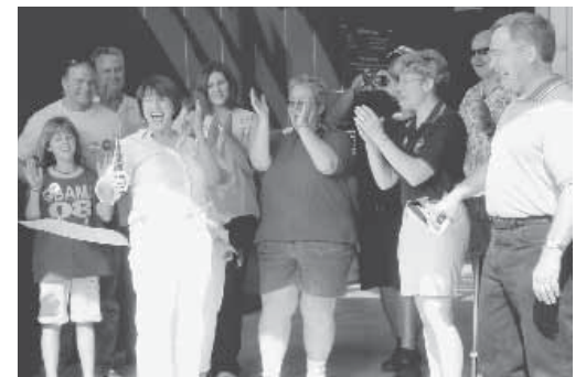
Senator Amy Klobuchar cuts the ribbon to open the building