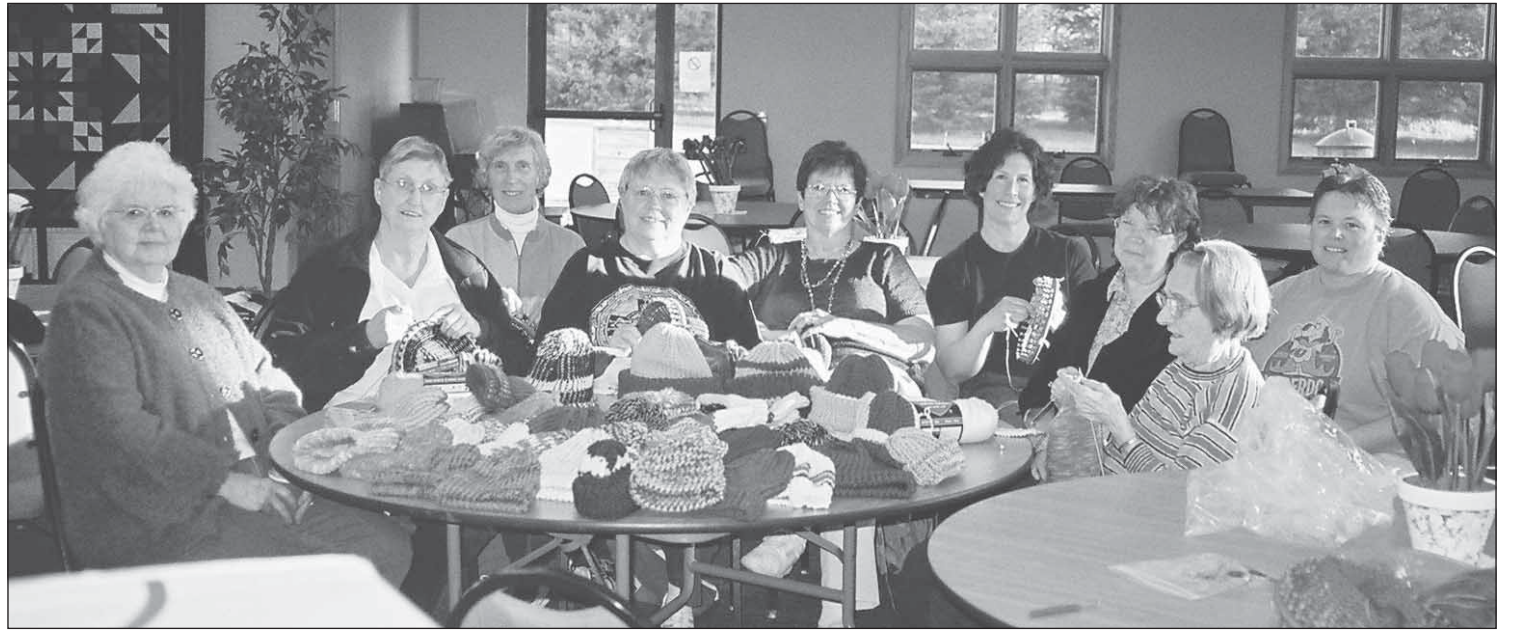
Knitting Group at First Congregational UCC, Mankato