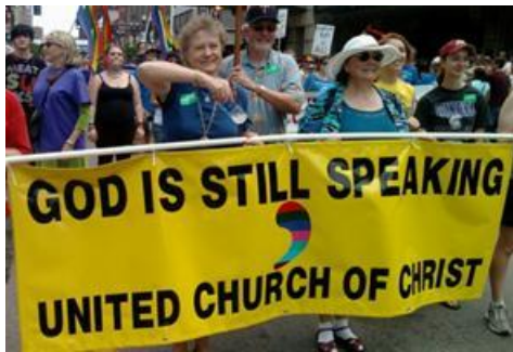
Minnesota Conference marches at the 2010 Twin Cities Pride Parade

This summer many of our churches will give witness to their welcome at the LGBT Pride events across the state. The third largest Pride celebration in the country is Twin Cities Pride which takes place in Minneapolis June 25-26. Many of our churches will be represented in the parade down Hennepin Avenue on Sunday. Bring your banner! Wear your church's t-shirt! Look for the UCC Coalition contingent and jump in. We will also have a booth in