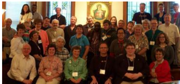
2010 ONA Gathering Participants